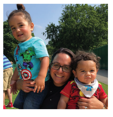
Thanks to the families whose photos appear in this publication.