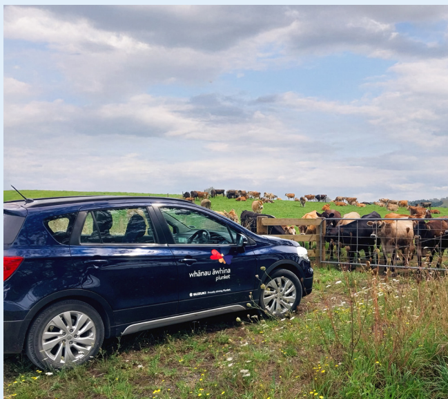
Shutting the gate before starting your appointment with a farming whānau is key – unless you want a four-legged dairy queen coming along for your next one!

“Always remember to close the gate behind you!”