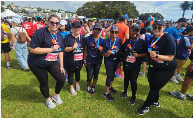
We had a fantastic turnout of athletes and fundraisers for the three Round the Bays events this year, including these wonderful Plunket team members!

Looking for your next fundraising event challenge? Dunk it for Plunket will be back this September! It may feel like a long way a way, but it's never too early to sign up and start planning to dunk a bikkie or three – or dunking anything you like – to help us keep being there for tamariki.